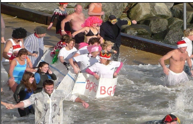
Members take an icy dip at the West Bay Wallow.

When brave members volunteered to test BGRC's first gig on Boxing Day, it soon became apparent that a few crucial details had been over looked.