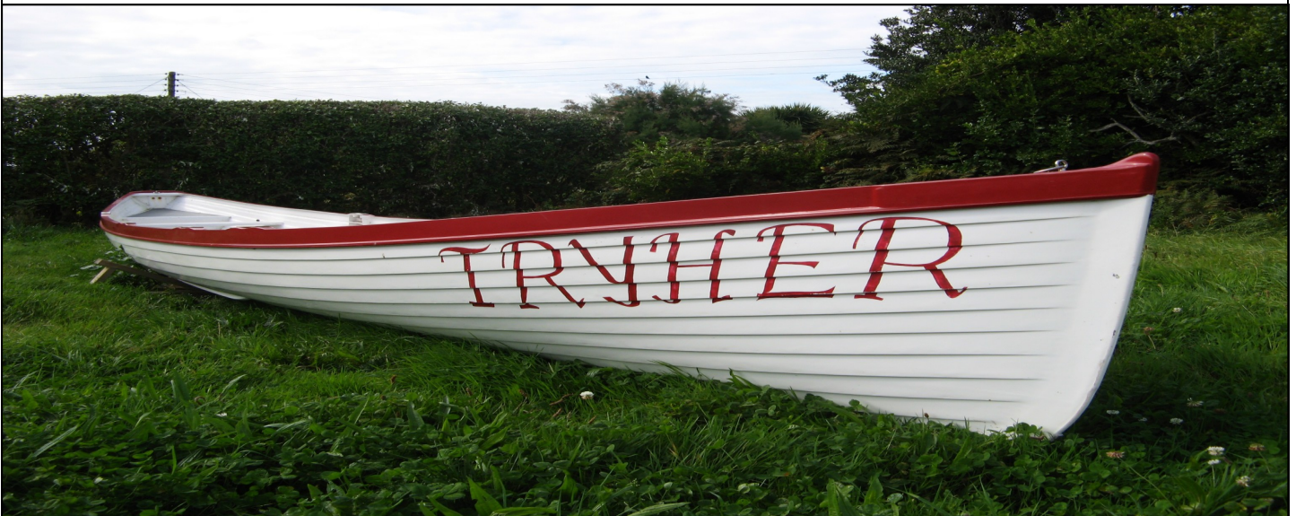
An example of a Plastic-Fibre Gig - Tresco, Isles of Scilly

I look forward to seeing you at club events in the new year and on the water in the spring!